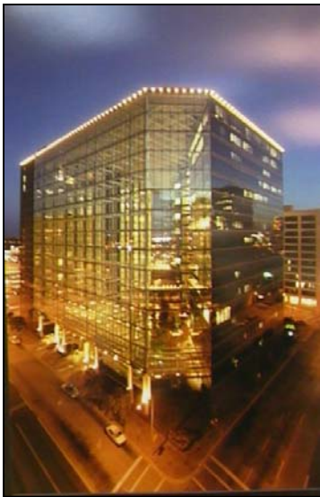
AUSTIN CENTRE Roof & repairs, renovation, waterproofing. Four floors of condos above an operating hotel. Tenant Improvements. (1,000,000 SF)