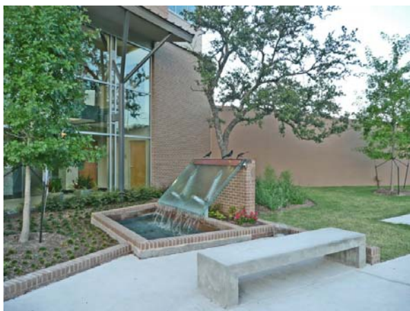
AUSTIN REGIONAL CLINIC- FAR WEST New medical office over new parking structure expands existing Austin facility