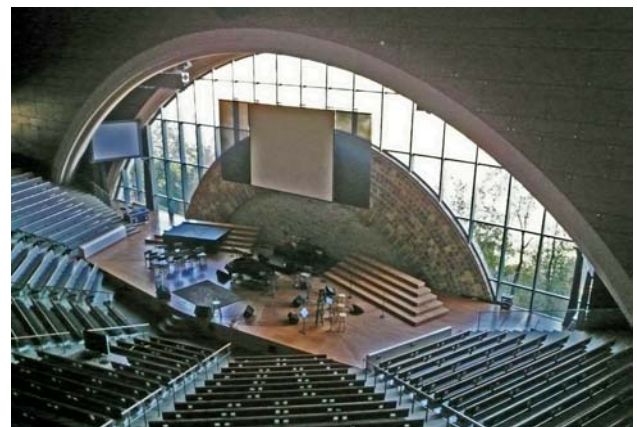
RIVERBEND CHURCH OF AUSTIN Daylighting, quadrangle renovation, site development, other renovations & additions