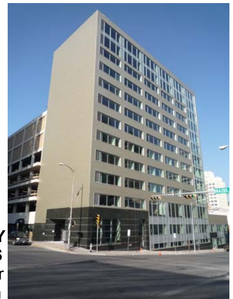
PERRY BROOKS Highrise exterior reconstruction