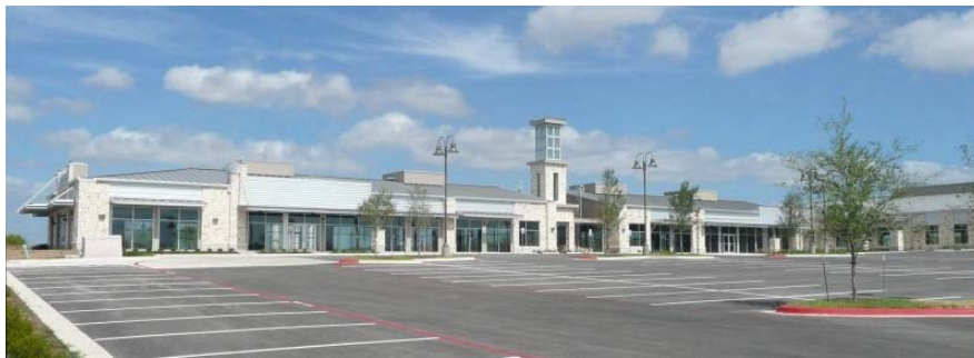
AUSTIN REGIONAL CLINIC- KYLE New medical office facility 36,000 S.F., Kyle, Texas